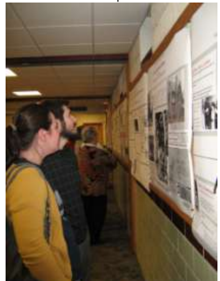
Attendees browse the posters of homes.