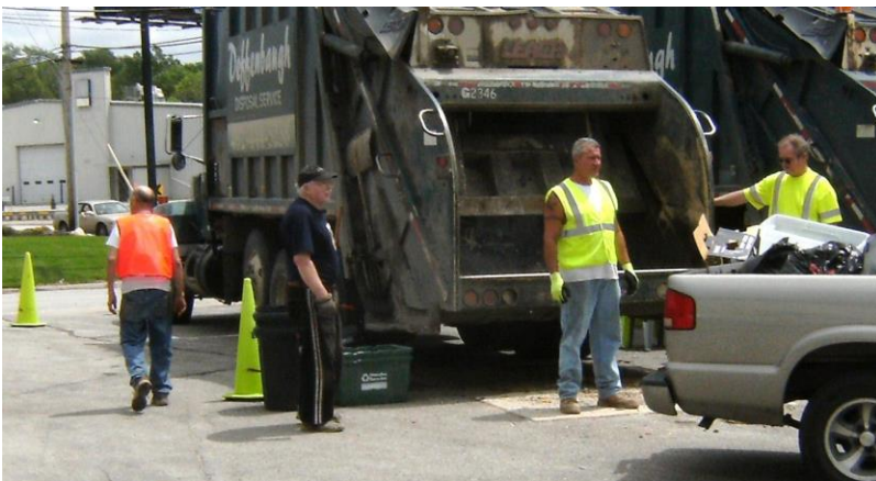
Volunteers and Workers at the Spring Dumpster Day