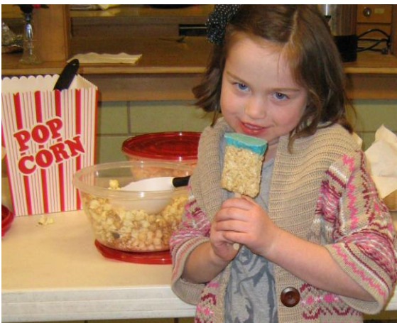
A little helper at the Mar. meeting, cleaning up snacks...