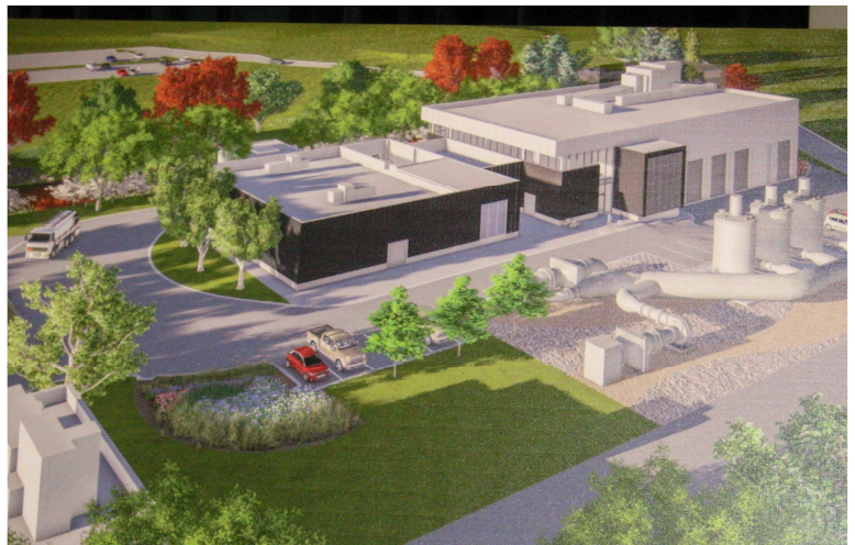
Rendering of CSO treatment plant

Members and guests alike enjoyed the soup, sides and sweets at the January meeting. Join us in March.