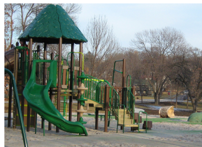
S/V Park playground equipment