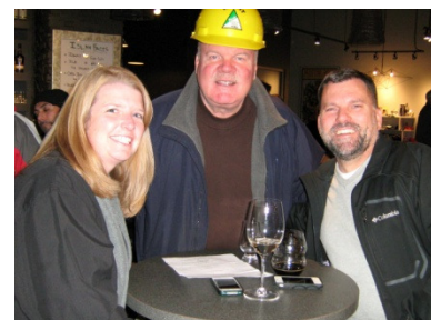
Gearing up for the tour and winding down afterwards at Spirit World.

January Business Meeting & Soup Fest Thursday, Jan. 15 6:30 PM