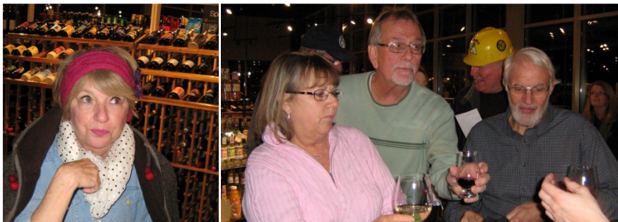
We had some fun at the new Spirit World!