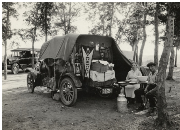
Elmwood Park Campground campers, circa 1923

Long distance travel in the early days of the automobile was difficult, and comforts along the way were few. Motorists pitched their own tents and cooked their own meals in the auto tourist camps that soon sprang up along the nation's roads. Some were free; others were operated by a commercial businessman. Pay camps, with more conveniences, soon became common.