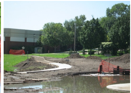
Park progress: from caterpillar parking lot to skid steer swimming hole.