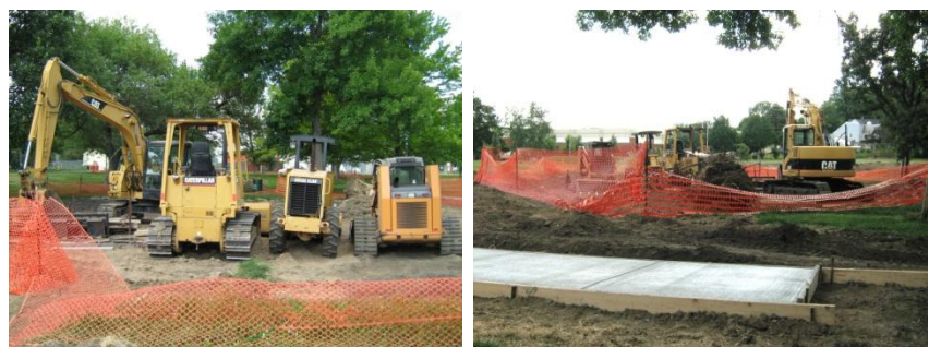
Caterpillar Exhibit – The park looks like a Caterpillar zoo with several species of on display.

Please bring: water or drinks (no alcohol, please) friends & neighbors chairs/blanket