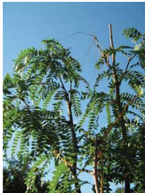
Locust on 55th Street

Go to www.treebenefits.com/calculator and enter the specifics for the