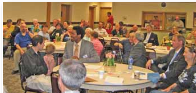
Candidate Forum at March meeting

April 28th Dumpster Day May 18 & 19 AEPNA Garage Sale June 9th - Garden Walk July 21st AEPNA picnic, Elmwood Park Pavillion