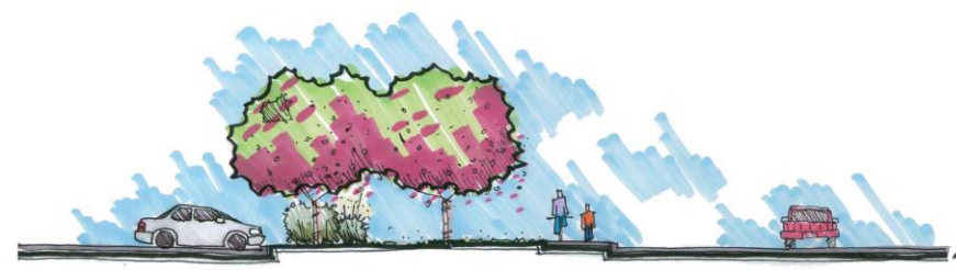
SECTION ALONG MAYBERRY