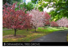
3 ORNAMENTAL TREE GROVE