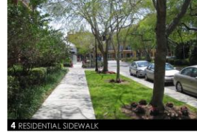
4 RESIDENTIAL SIDEWALK