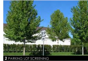
2 PARKING LOT SCREENING