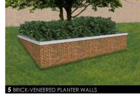
5 BRICK-VENEERED PLANTER WALLS