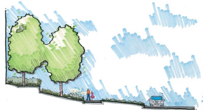
SECTION ALONG 51 ST ST