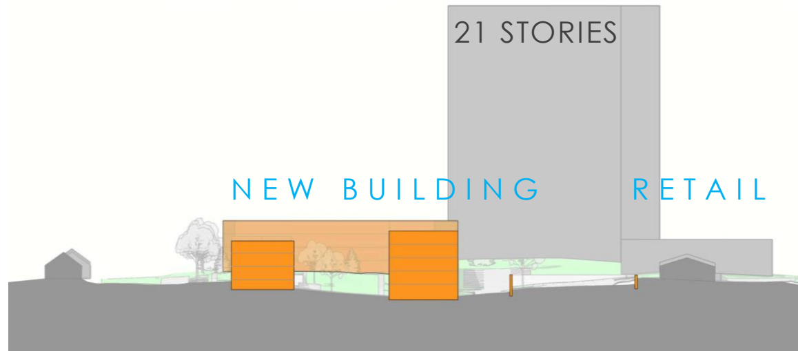
SITE SECTIONS:NEW APARTMENTS