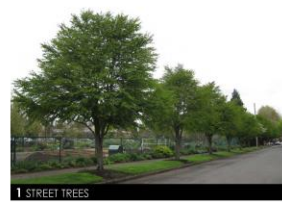
1 STREET TREES